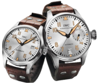
40 Pairs Watch