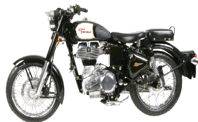
1600 Pairs Royal Enfield (Rs. 1.2 lac.)