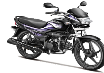
Next 800 Pairs Bike (Rs. 60000)