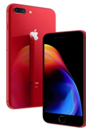
Next 80 Pairs Android (Rs. 10000)