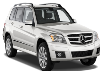
Next 5000 Pairs Car or Gold (Rs. 6 lac.)