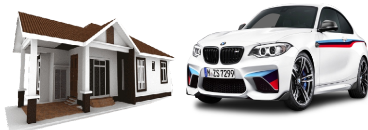
Next 50000 Pairs BMW or Bunglow (Rs. 60 lac.)