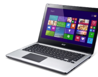
Next 400 Pairs Laptop (Rs. 30000)