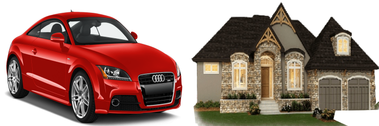
Next 80000 Pairs AUDI or Bunglow (Rs. 95 lac.)