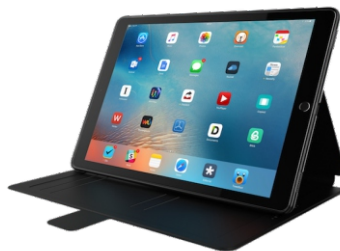
Next 200 Pairs Tablet (Rs. 15000)