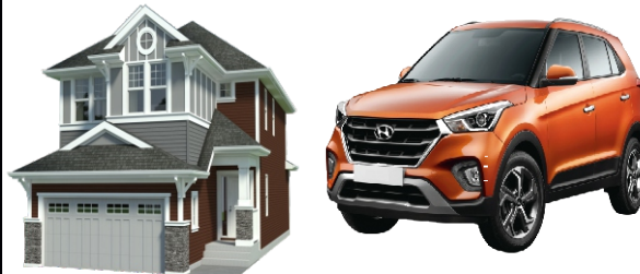
Next 20000 Pairs Car or Flat (Rs. 24 lac.)